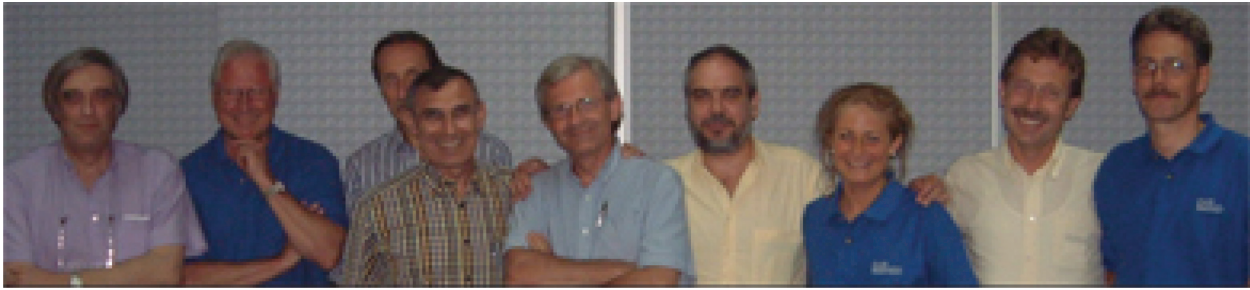
Figure 1: Founders of EASI.