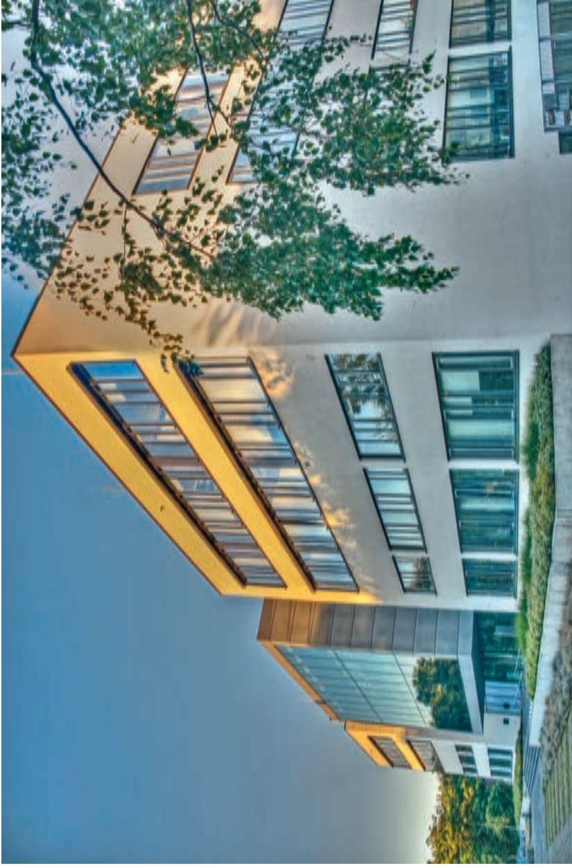
The congress venue 2013: Centre for Regenerative Therapies (CRTD) in 01307 Dresden, Fetscherstrasse 105